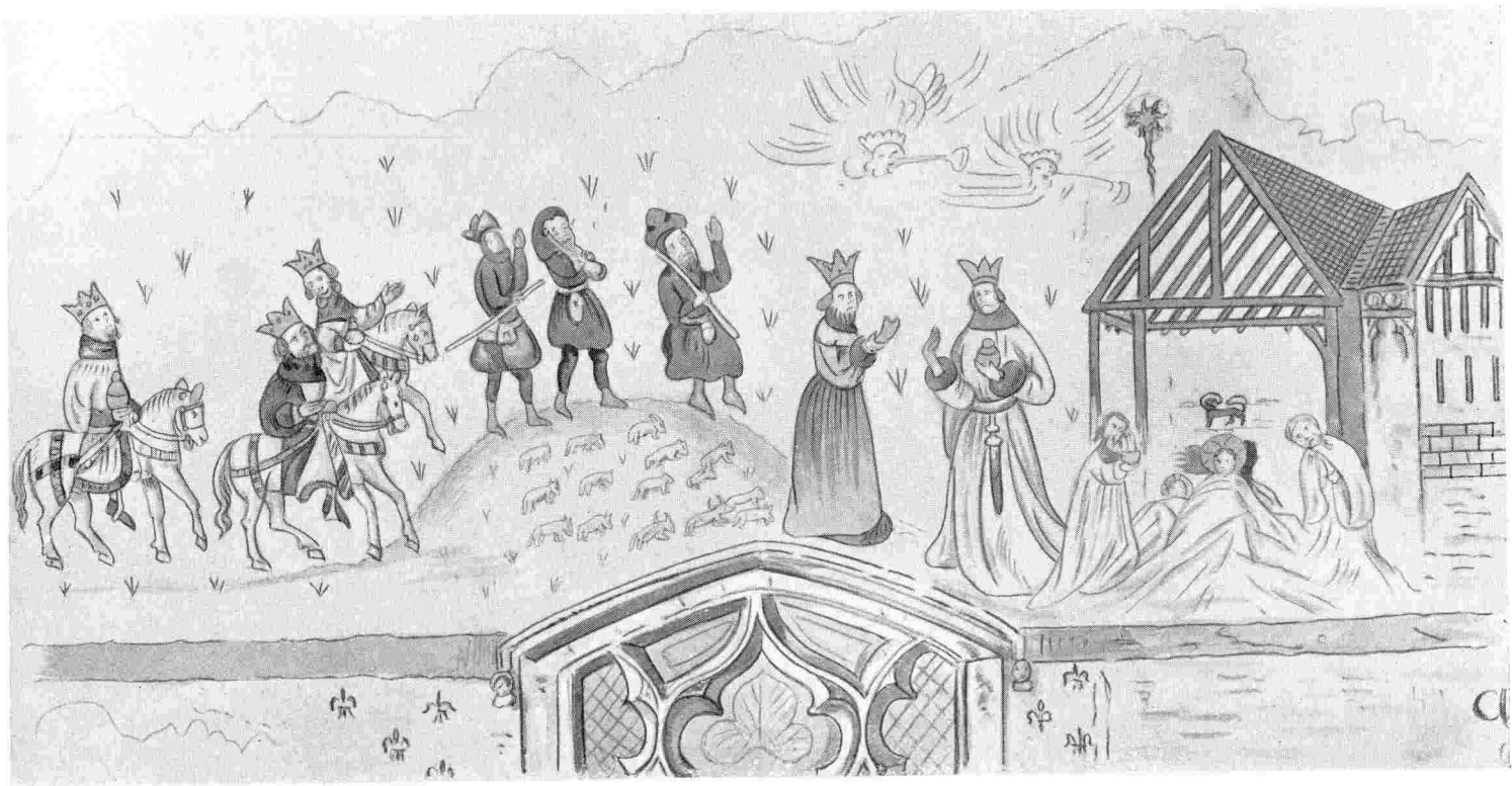
The journey of the Magi — The message to the Shepherds. The Adoration of the Magi — The Nativity.