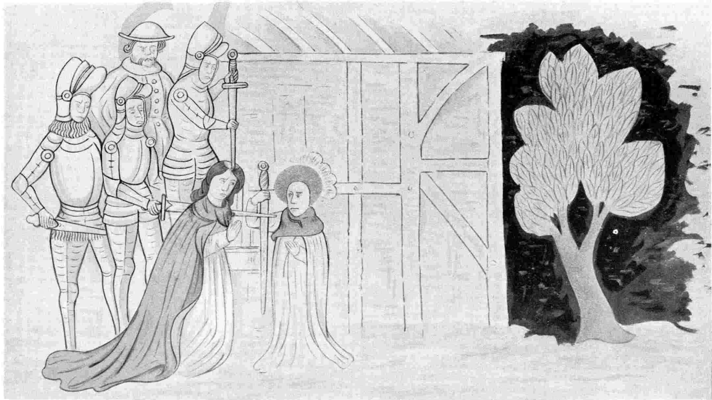
First State. Martyrdom of St. Thomas a Becket. Second State. Figure of St. Catharine interpolated.