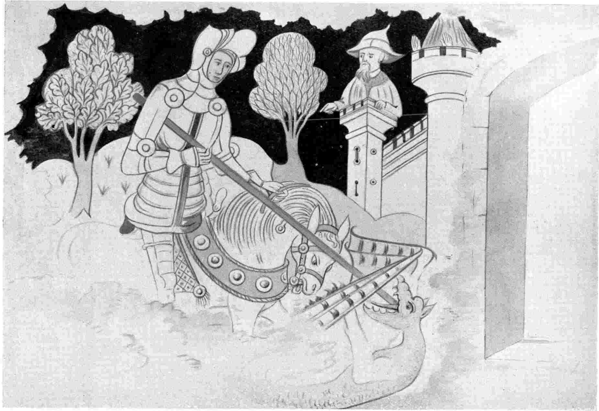
St. George and the Dragon.